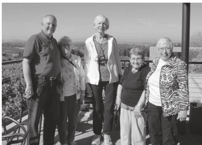
The "Wondering Jews," our 65+ group, at Ponzi Vinyard for an afternoon of wine tasting.