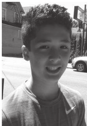
Congregation Neveh Shalom