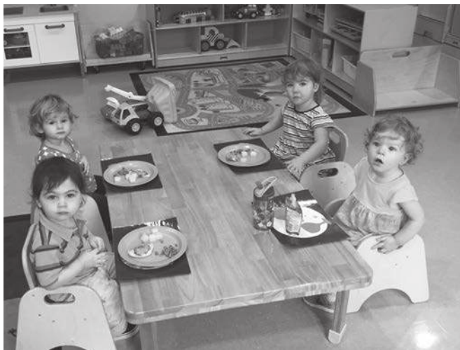
Foundation School's Monkeys in their new classroom