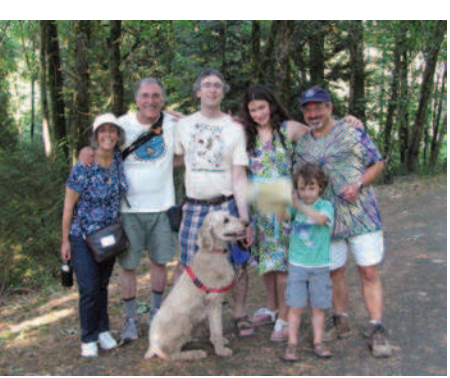
Back to Shul Hike -Woods Memorial Park, September 7