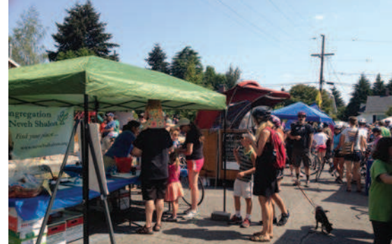
Our tent at Sunday Parkways on August 24.