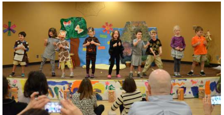
Spring 2014 Pre-K play