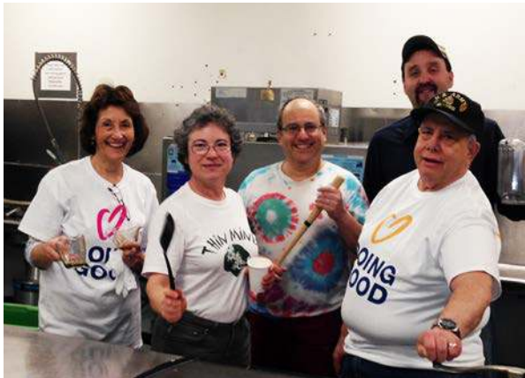
Good Deeds Day, March 2014