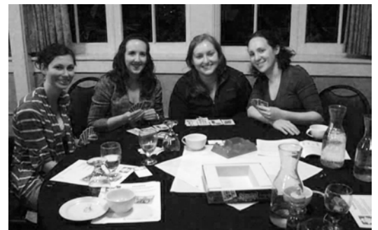
Picture from Shvuot Dinner, May 15