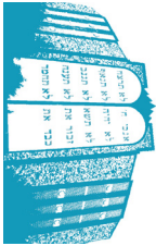
Congregation Neveh Shalom