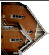
St. Andrews Church