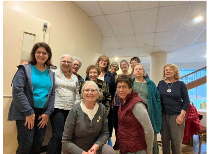
Potluck last September

Joint program with “Art, Heart, and Soul”